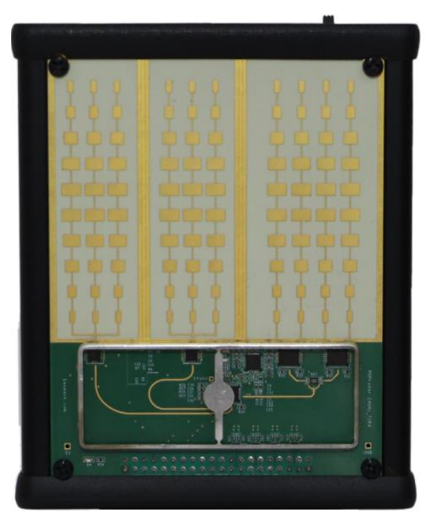
Figure 1. PUP_DUAL24P_T2R4

Raw data can be recorded for post-processing.